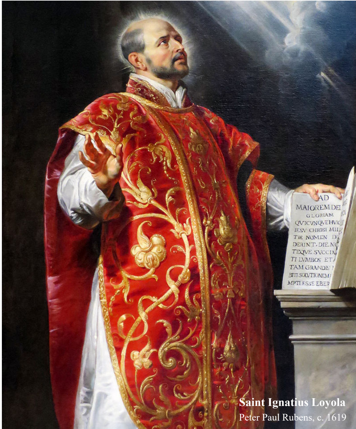
Saint Ignatius Loyola Peter Paul Rubens, c. 1619